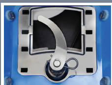
Stainless Steel Carving Blade for Ice Melt and Bagged Salt